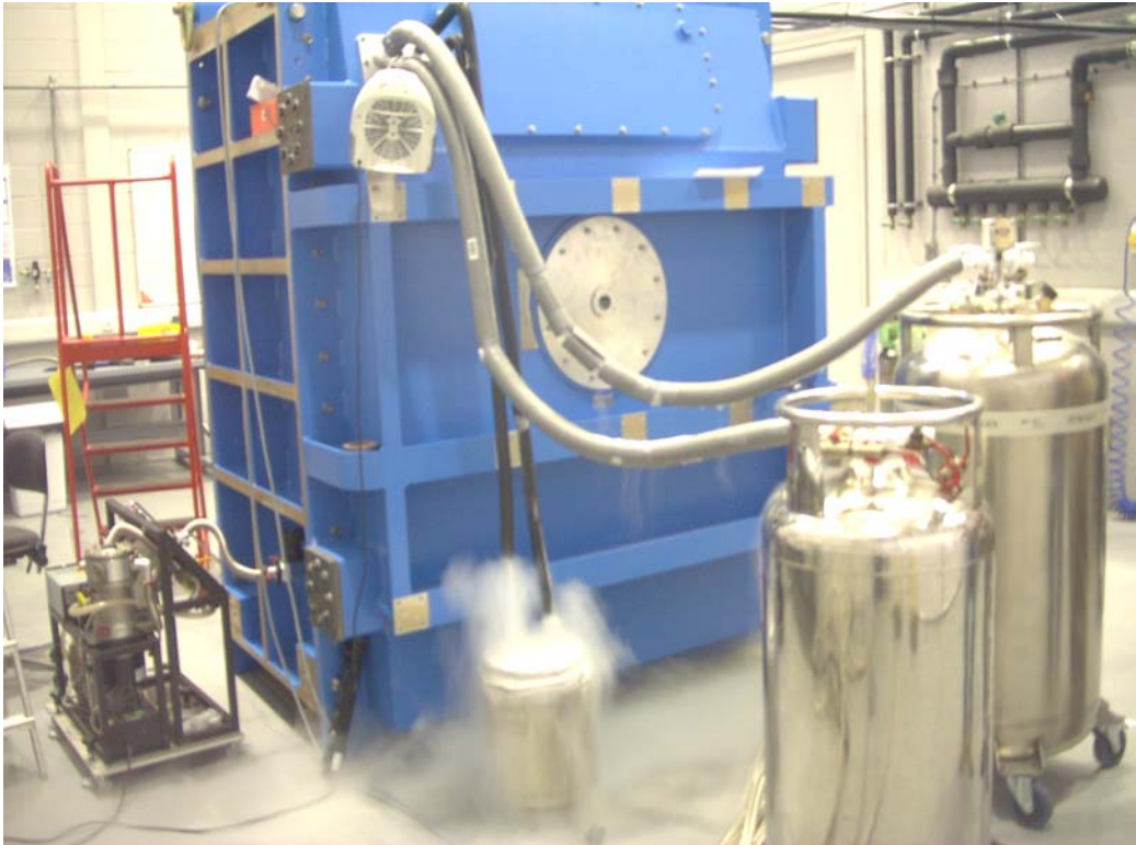
Photo 19: Liquid Nitrogen pre-cool underway with PTCs switched-on.