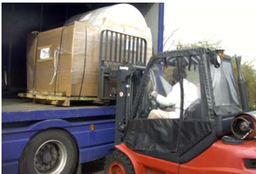
Photo 7: 60K Radiation Shield arrives at UK ATC.